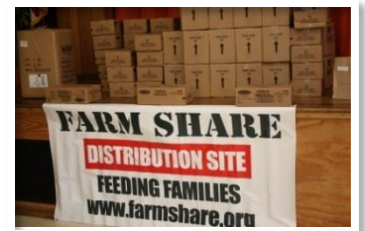
GCHSC distributes food donated by Farm Share to families in need at the 2013 Community Baby Shower.