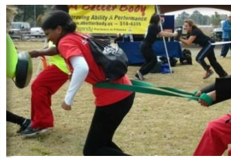
Gadsden Women's Health Walk Participant taking the "Better Body Fitness Challenge."

GCHSC is also a member of the Florida Association of Healthy Start Coalitions (FAHSC).