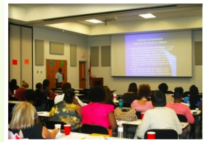
Cultural Competency Training

We facilitate instructional seminars for agencies and local businesses working with families.